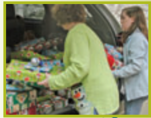
St. Joseph Page 1

2 All-on-Four™ The NobelGuide™ Treatment Concept Benefits of Immediate Function™ The Procera® Advantage Program